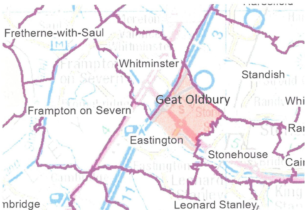
Suggested (this document) boundary of Great Oldbury Parish Council.

The two maps below highlight, in graphic form, the ridiculous nature of the proposal suggested in the Governance Review.